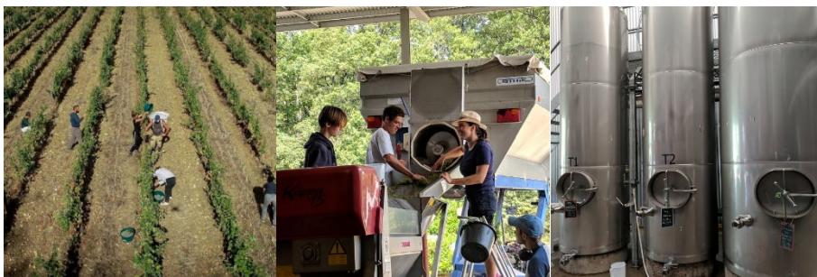
Handpicking – hand sort, destem, and crush grapes – temp controlled fermentation tanks