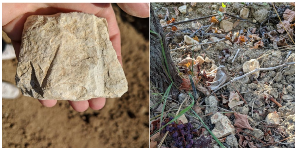
Bourré limestone Tuffeaux and flinty Silex