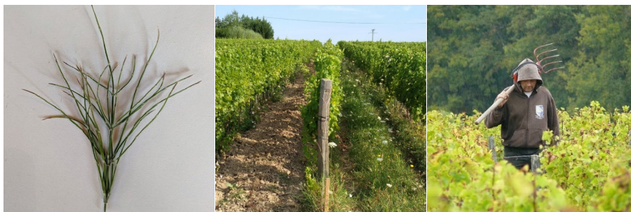
Prêle – alternate row green fertilizer herbs – hand ploughing