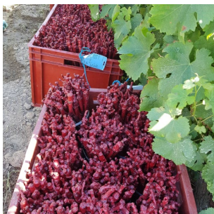
New vines ready to plant